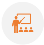
8.2.A - STUDENT LEARNING OUTCOMES (EDUCATIONAL PROGRAMS)